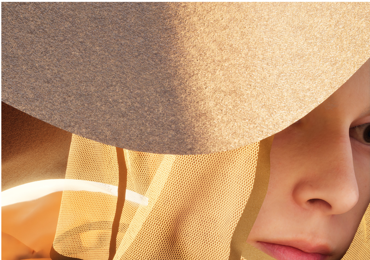
Lito Kattou, South Eastern South , 2025. 4K software based real-time algorithmic video, HD sound, still image