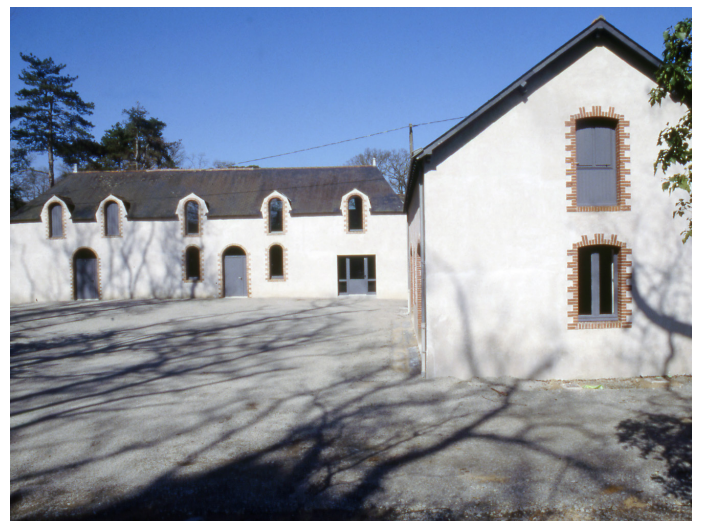
Artist residencies at the Frac in Carquefou