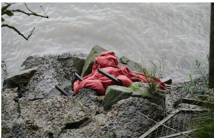
Jota Mombaça, Sculpture sinking . Nantes 2023.