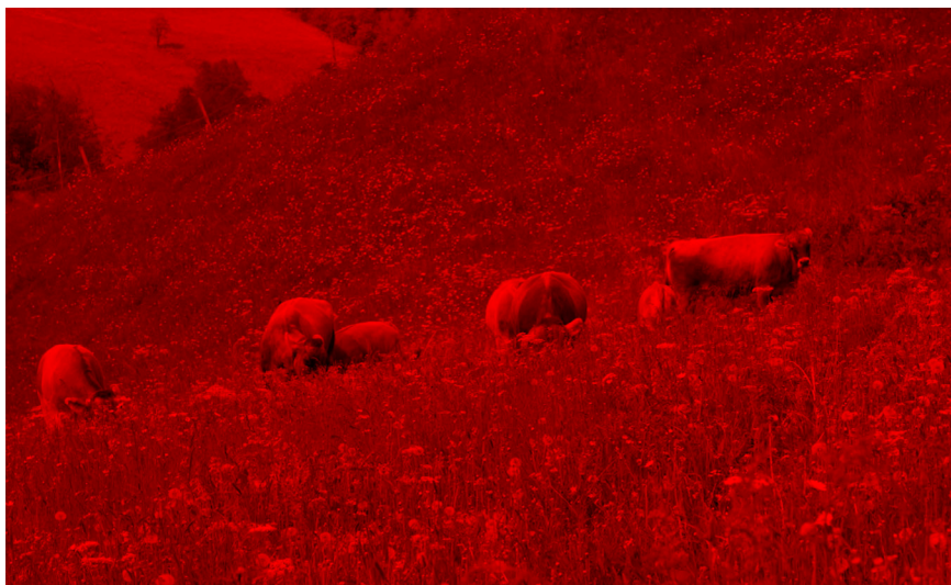
Ohan Breiding, still from Belly of a Glacier , 2023